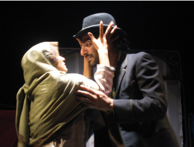
Above: Duleep Singh reunites with his mother Maharani Jind Kaur 'Maharajah and the Kohinoor'

Duleep Singh was the Maharajah of Lahore, (King of the Sikh Empire), who was exiled by the British at the age of eleven and sent to England. He arrived on the shores of England and immediately became a court favorite of Queen Victoria, who showered affection upon the turbaned Maharajah, so beginning an unlikely relationship of love and loyalty. The Maharajah was looked upon as an adopted son of Her Majesty, encouraged to mingle with the household, play with the younger Princes and holiday with them at Osborne House. His princely appearance and native ways 'were a sheer joy' for the Royal Family.